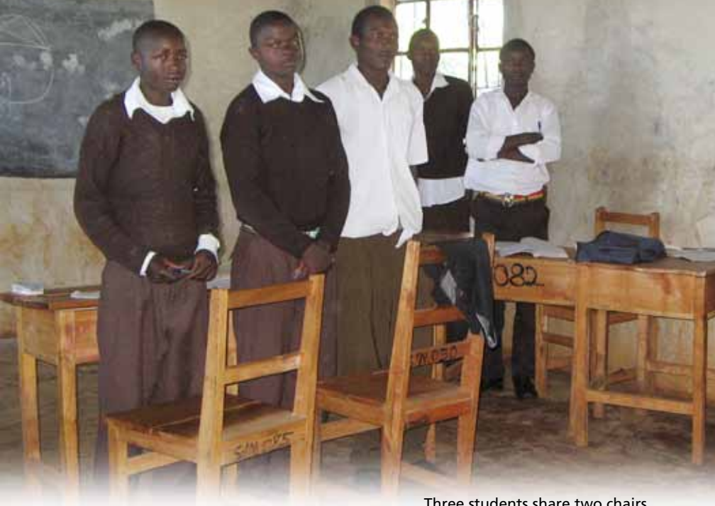
Three students share two chairs

than priests coming to visit the family. The Oblates can bring prayer, the sacraments and encouragement, but, as Henri Nouwen once said, “the best healer is the wounded healer.” They want to restart the monthly meetings that used to draw people from great distances, and the cost of a meal is about $200 to feed the expected 300 – 500 who attend.